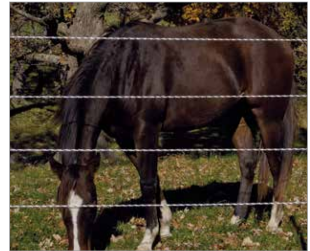
Illustrates the visibility of Premier's black/white ropes against different backgrounds.